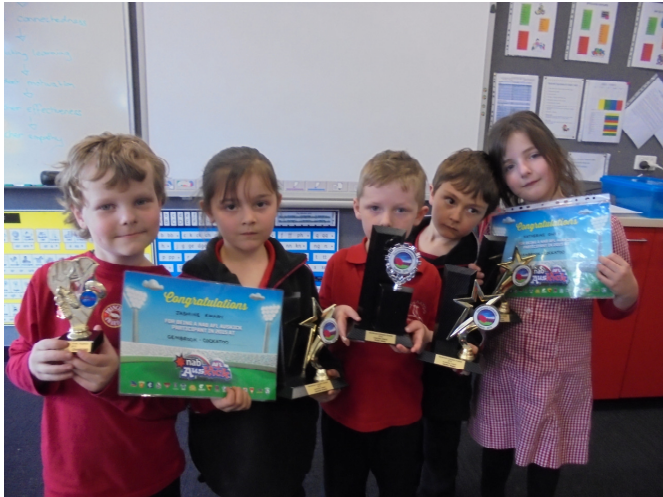
Auskick Participation 2015