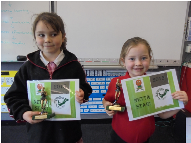
Netta Netball Participation 2015