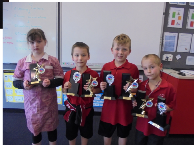
Auskick Coaches Awards & MCG